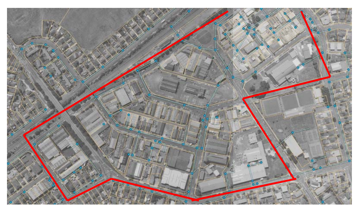
Photo 1: location of the main area in Naenae where audits will take place

The area where the majority of the audits will take place is bordered by Cambridge Terrace, Clendon Street, Naenae Road, Everest Ave and Vogel Street. There is a small industrial area on Rata Street which will also be assessed.