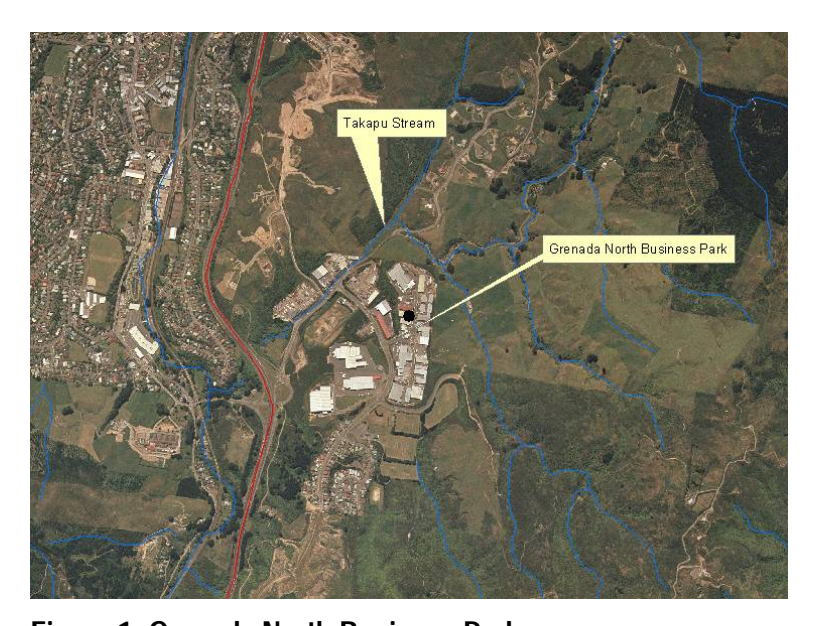
Figure 1: Grenada North Business Park

Since 2007 the Environmental Protection team have applied the Take Charge work programme in the industrial Grenada North Business Park (see figure 1).