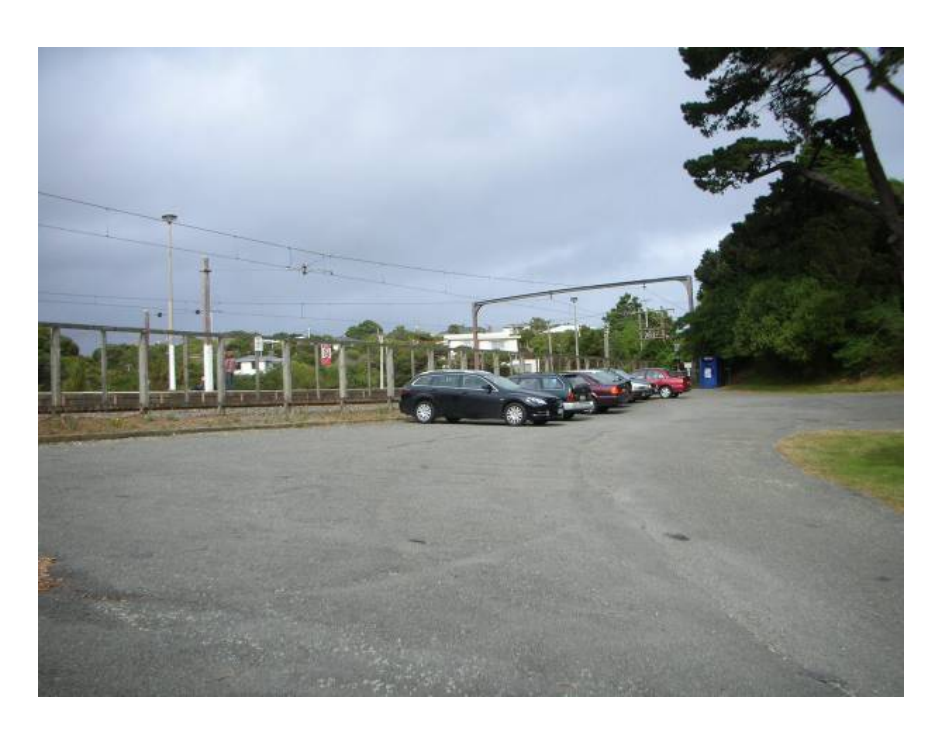
Figure 4. Park and ride space at Pukerua Bay Station

The estimated number of existing peak hour passengers using Pukerua Bay Station is 90. This is based on the last passenger count conducted in December 2006 adjusted with passenger growth rate figures.