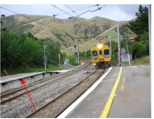
Figure 2. Muri Station – timber platform structure and temporary wooden reinforcement

If any money needs to be spent on keeping Muri open then $750,000 represents the least amount that has to be spent. A total of $1.4M would be required to fully replace the platform.