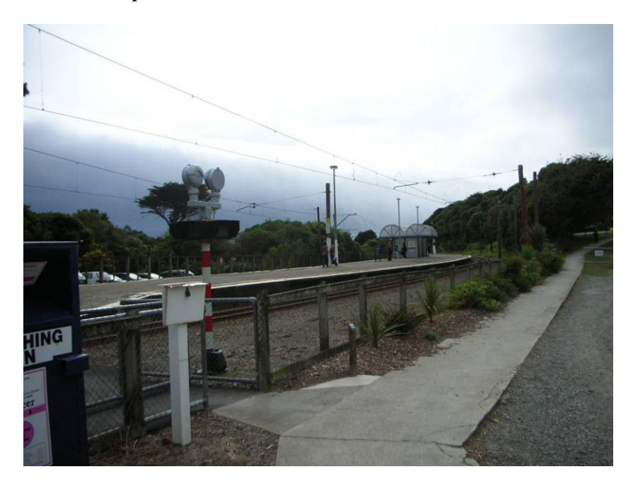
Figure 5. Pukerua Bay Station platform and shelters

If Muri Station area passengers are going to use Pukerua Bay Station, during peak hours, the number of passengers could be increased from 90 to 120. Pukerua Bay Station has a large centre platform therefore platform congestion will not be a problem.