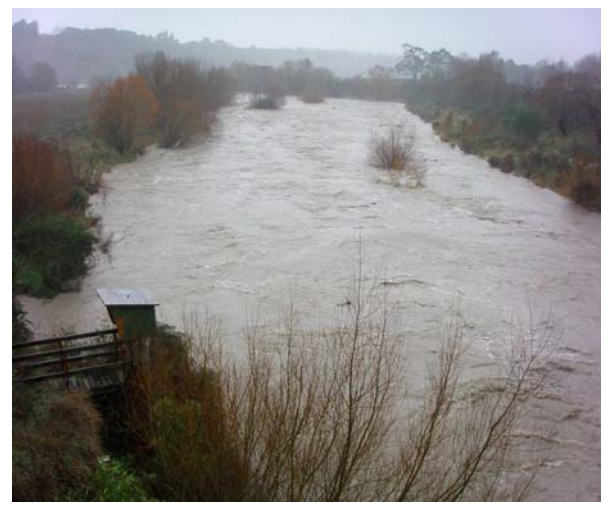
Huangarua River at Hautotara in flood

Autumn rainfall was around average in most western and central parts of the region (Tararua Range, Kapiti Coast, Hutt Valley) but well above average in the Wairarapa - probably the result of a predominantly easterly airflow associated with the tail end of a strong La Nina climatic state. Northern and eastern parts of the Wairarapa were with particularly wet