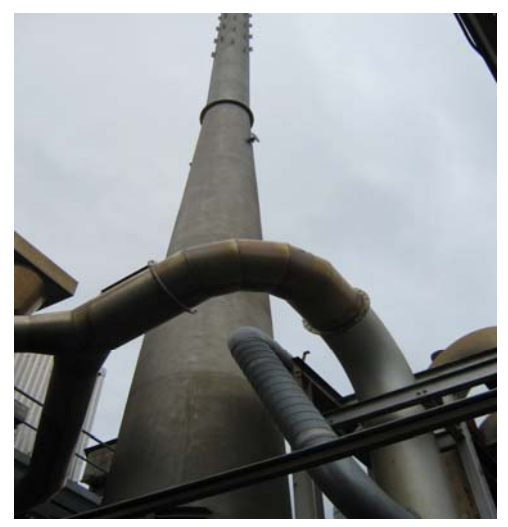
Exide Technologies stack at their Waione Street plant. The stack will soon be taken down as part of Exide's plant decommissioning work.

Exide Technologies Limited decommissioning: Exide gained a consent in late April to decommission the battery recycling facility, following the Plant closure on 31 March. The decommissioning of the plant involves the of cleaning and removal machinery, the removal of the stacks and air treatment systems and the cleaning of the interior and exterior of the building. The decommissioning does not involve the deconstruction of the buildings or the digging