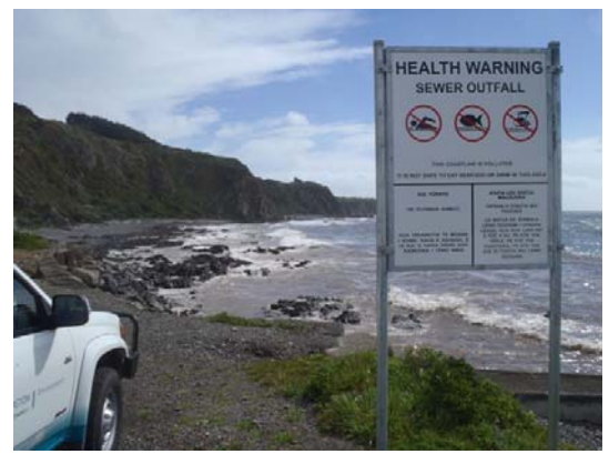
A sewage overflow event at Porirua City's sewer outfall south of Titahi Bay

222 incidents were notified and responded to in the quarter, down from 237 in the previous quarter. A summary breakdown of incidents is reported 6-weekly through the Councillor's Bulletin.