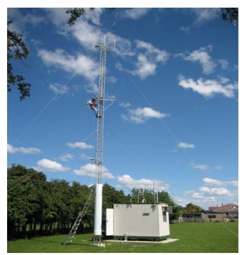
Air quality monitoring station

During the winter to date there have been three exceedences of the National Environmental Standard (NES) for PM<sub>10</sub>