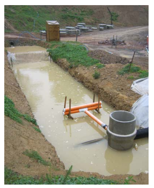
A sediment retention pond at the Westchester Drive extension, Churton Park

Earthworks site scoring system: We have finished our first season roll-out of the compliance points scoring system for earthworks sites. The system is now being used on all large earthworks sites in the region - mainly within Porirua the Harbour catchment, but also around the region from Waikanae in the north to the construction of the Masterton Wastewater Treatment Plant in the Wairarapa. Our officers are finding it a useful tool for engaging with consent holders. consultants and contractors