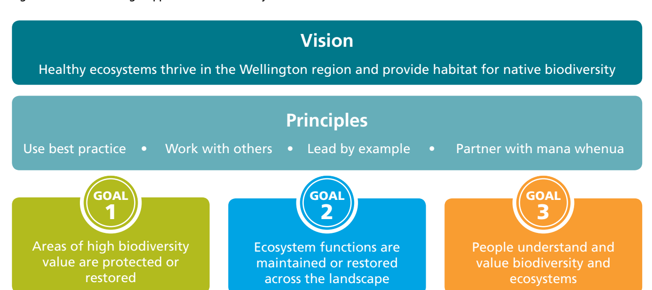
Figure 1. GWRC's strategic approach to biodiversity

The Strategy sets out a vision for the region which is underpinned by four operating principles and three strategic goals (see Figure 1). A set of objectives outline what we will do to achieve the goals. Departments across GWRC will work towards the Strategy's vision while carrying out their core functions.