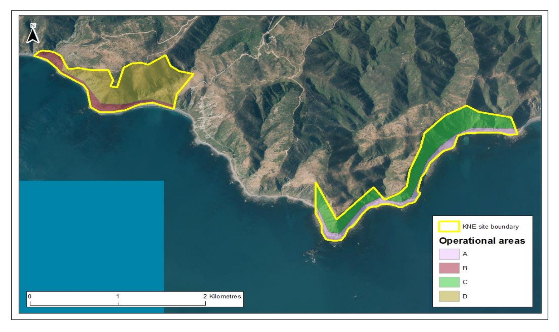
Map 2: Ecological weed control operational areas in the Wellington South Coast KNE site