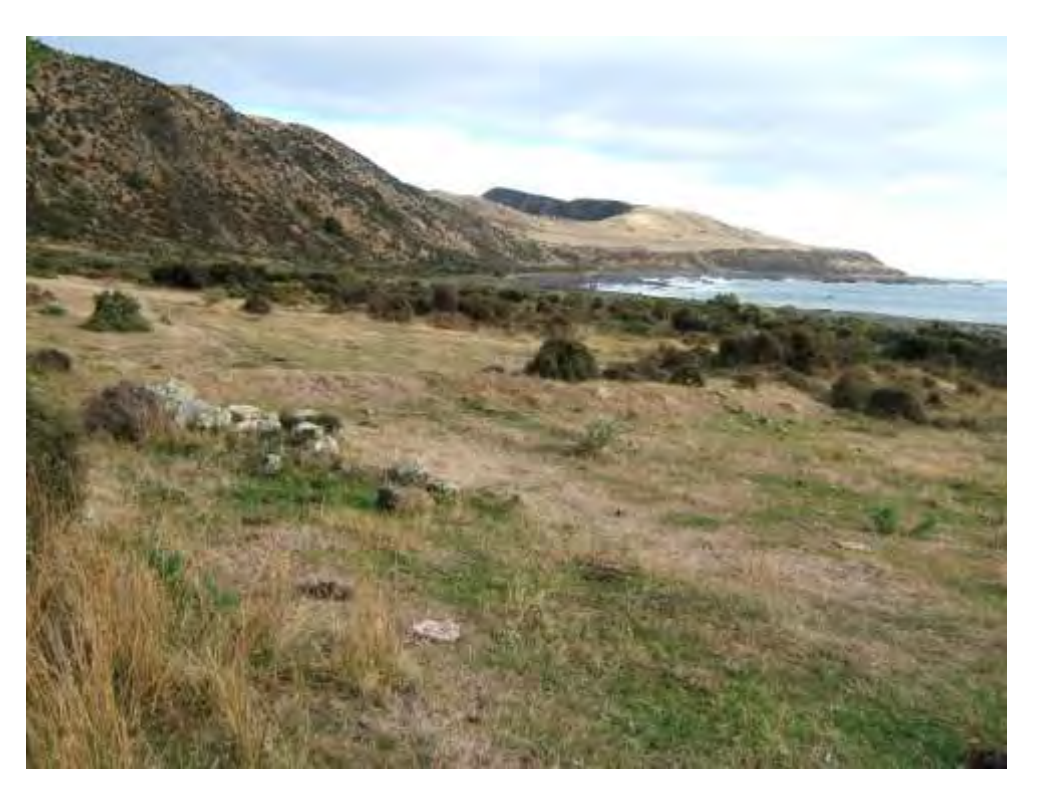
View from the Takarangi Block to Baring Head near the Okakaho Stream.