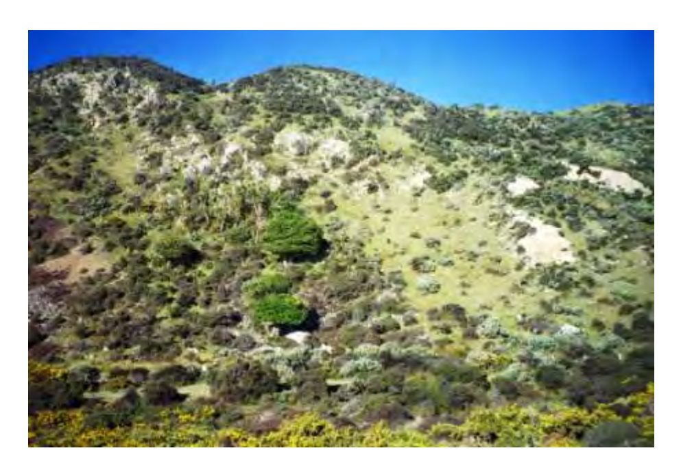
Ti Kouka (cabbage trees) and Karaka trees slightly west of Te Rae-o-Paua