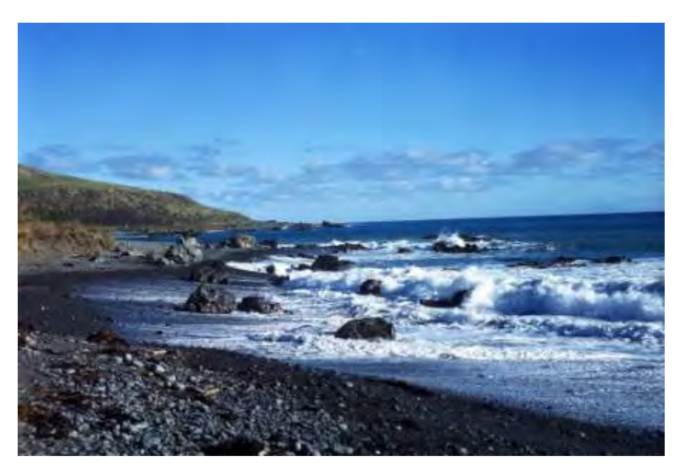
Te Rae-o-Paua in the distance