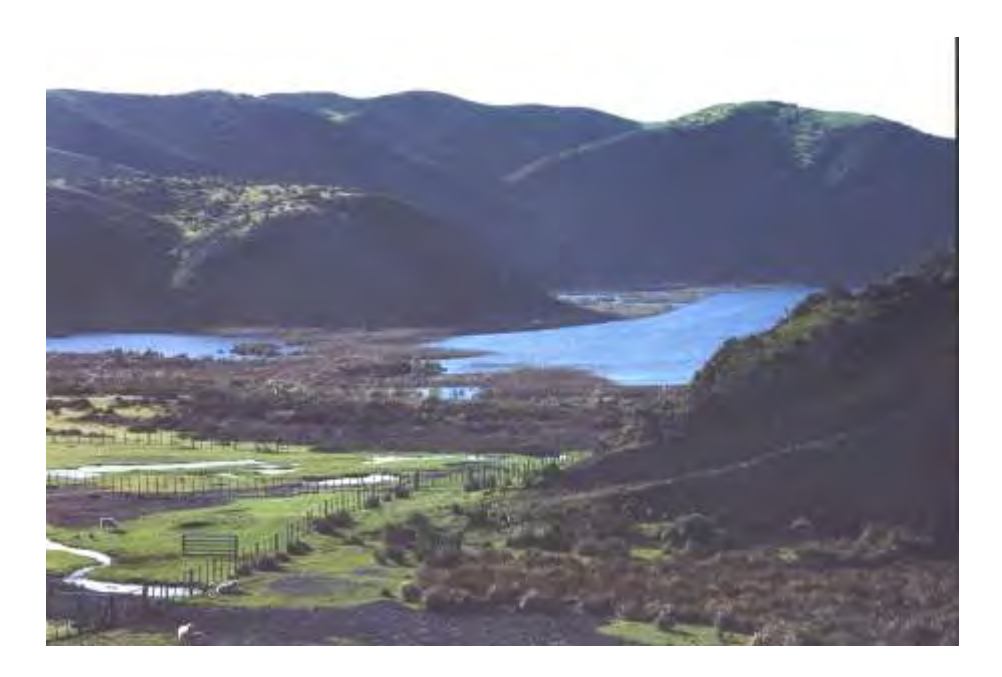
Kōhanga-te-rā at Pencarrow Station from Curtis Road