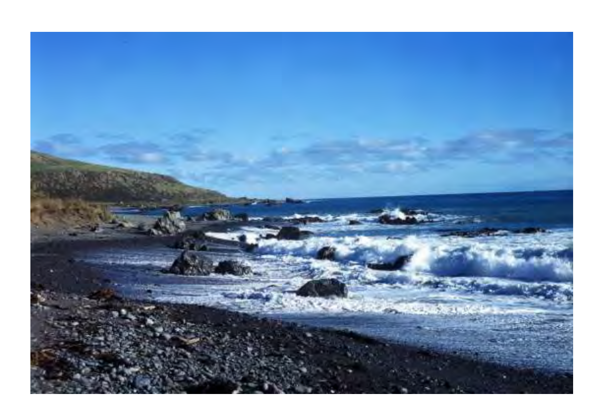
Cultural Values Report February 2011