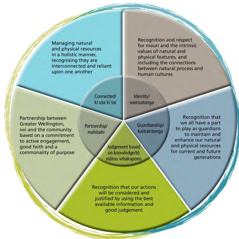
Figure 1.1: Te Upoko Taiao’s principles to guide the review of the regional plans

The make-up of the committee and these guiding principles reflect an understanding that mana whenua, the Council and the wider community all share the responsibility of caring for the Region’s environment. Ongoing collaboration between regulators, resource users, mana whenua, the government and the wider community is already in place and can be further built on to manage the Region’s natural and cultural resources effectively.